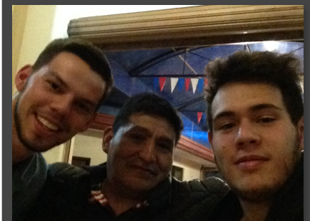
TOP: Pastors retreat in Bolivia.